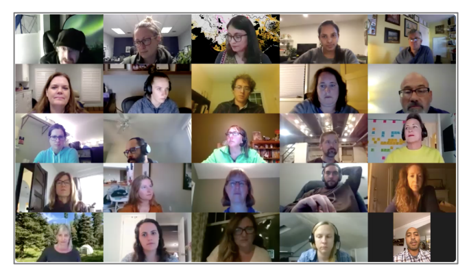
Participants from the Fall 2020 Evening Program