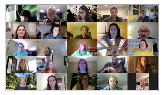
Participants from the Fall 2020 Evening Program